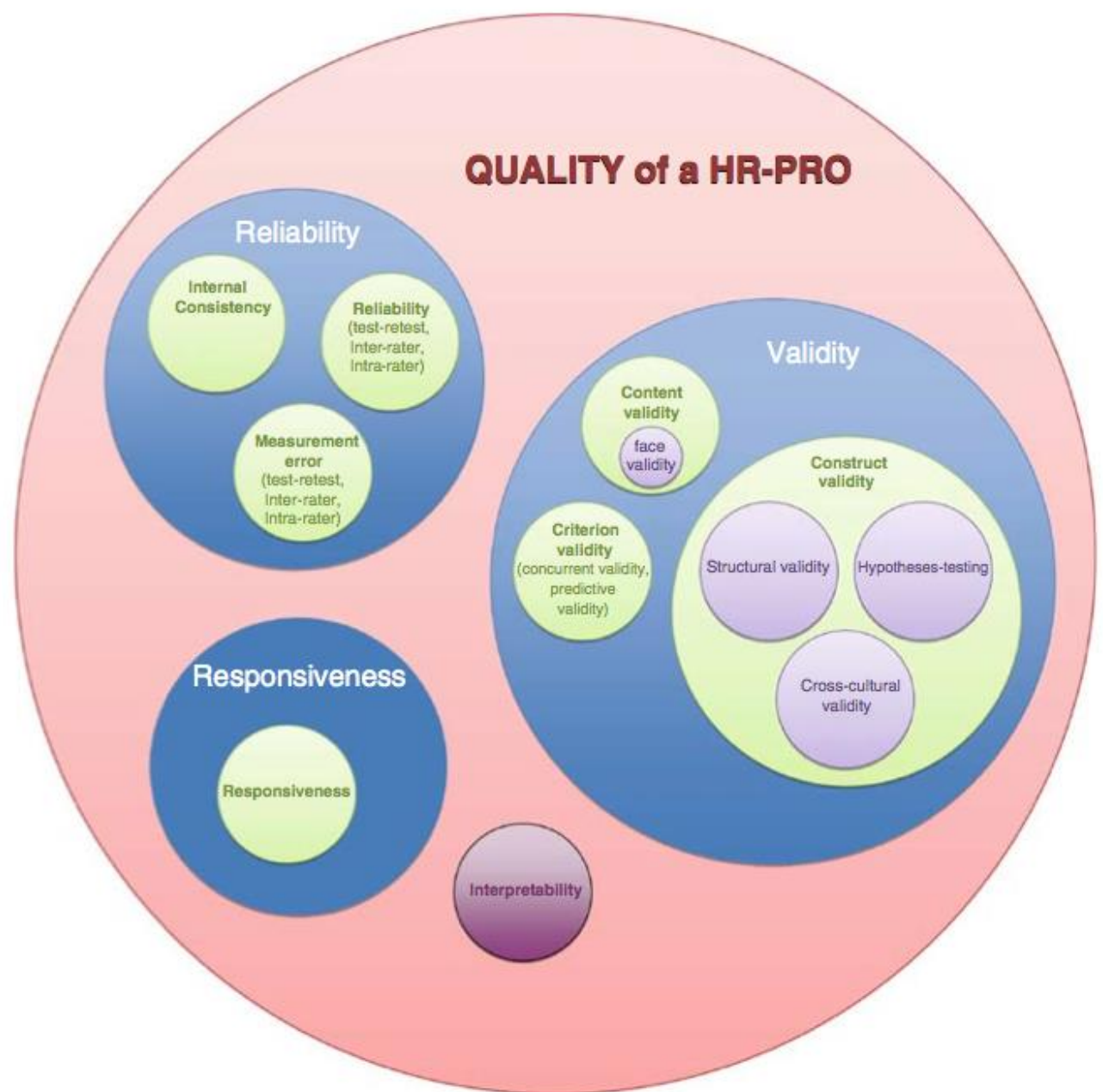
Fig. 1 COSMIN taxonomy of relationships of measurement properties

Mokkink LB et al. The COSMIN checklist for assessing the methodological quality of studies on measurement properties of health status measurement instruments: an international Delphi study. International Journal of Quality of Life Aspects of Treatment, Care and Rehabilitation, 19(4), 539–549.