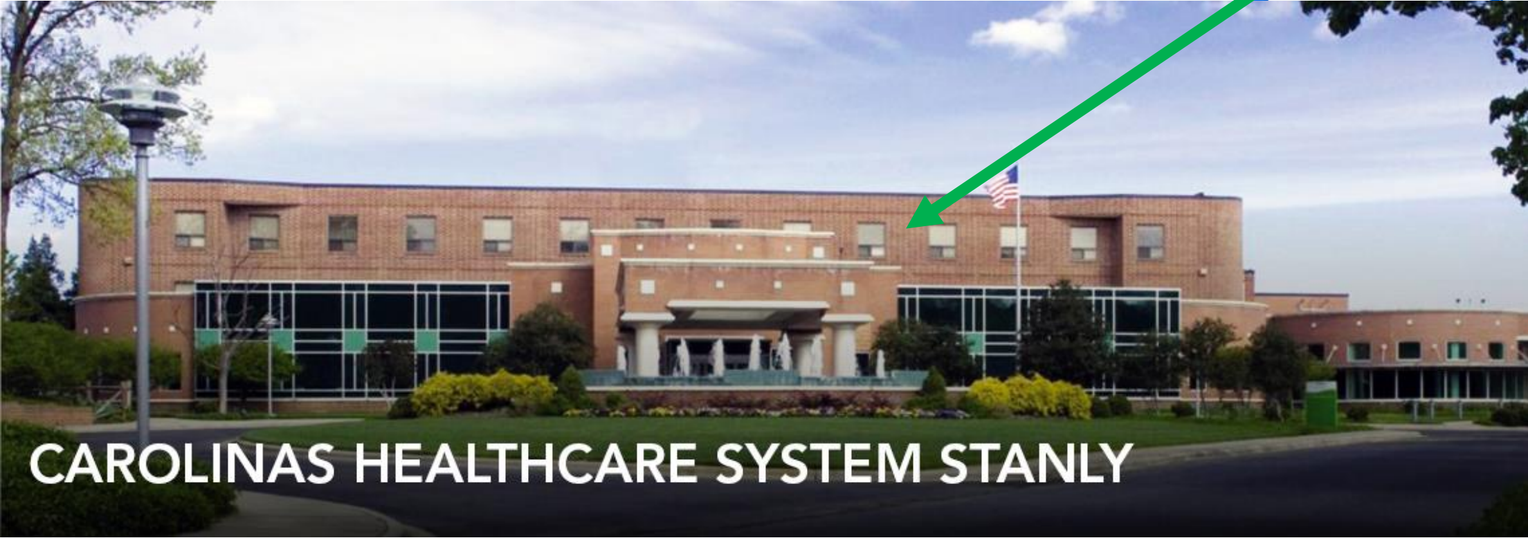
CAROLINAS HEALTHCARE SYSTEM STANLY